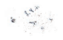
Fine Metallic Particles (with the inclusion of a rare magnet)